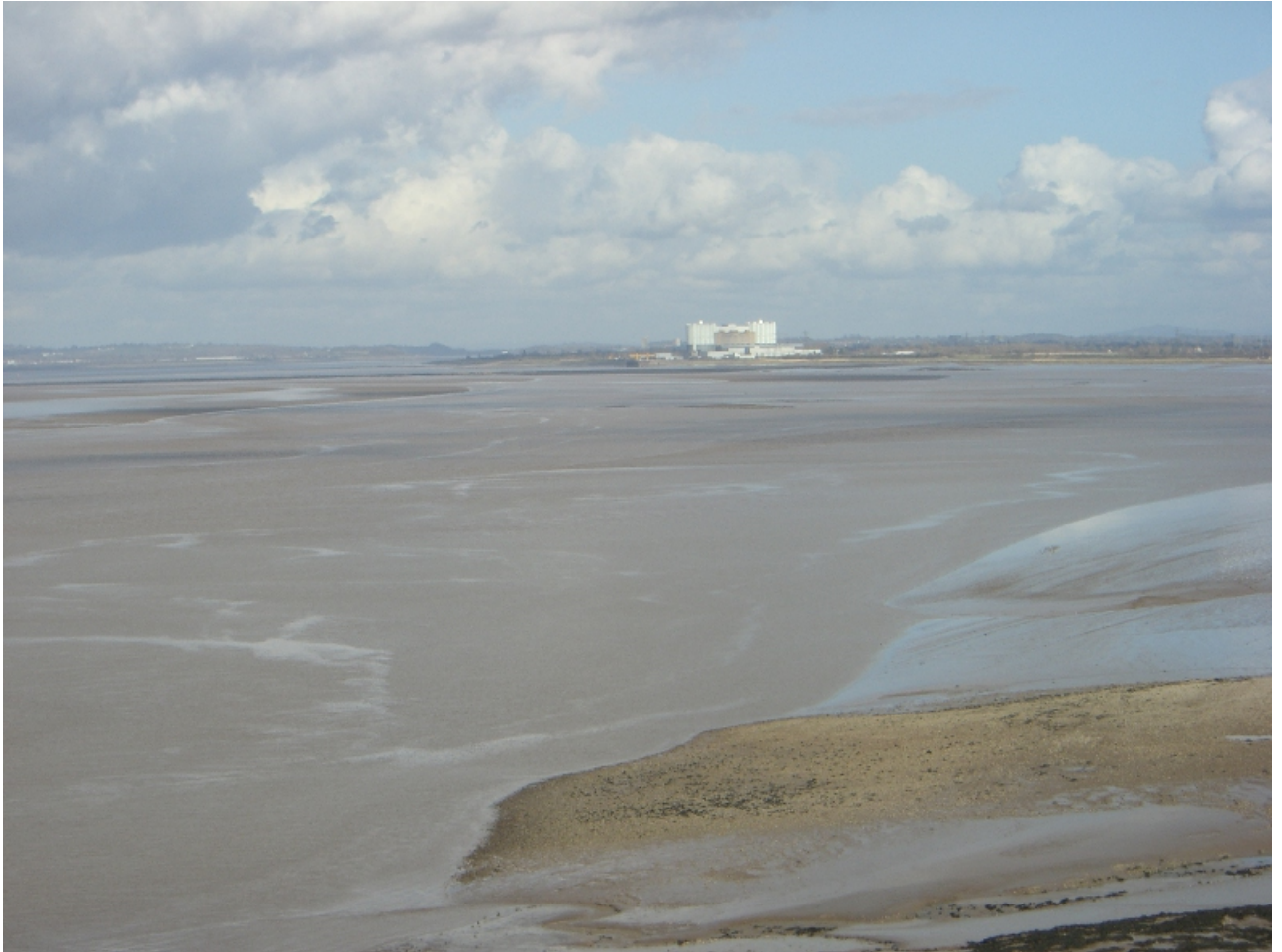
Oldbury Nuclear Power Station (decommissioned 2012)

I'm the bridge of destinations For pedalers to explore Chepstow as a first stop Right through Wales' door. I'm the bridge to border country Wales and England you can weave A glorious descent of Wye Valley Comes before Brockweir heave.