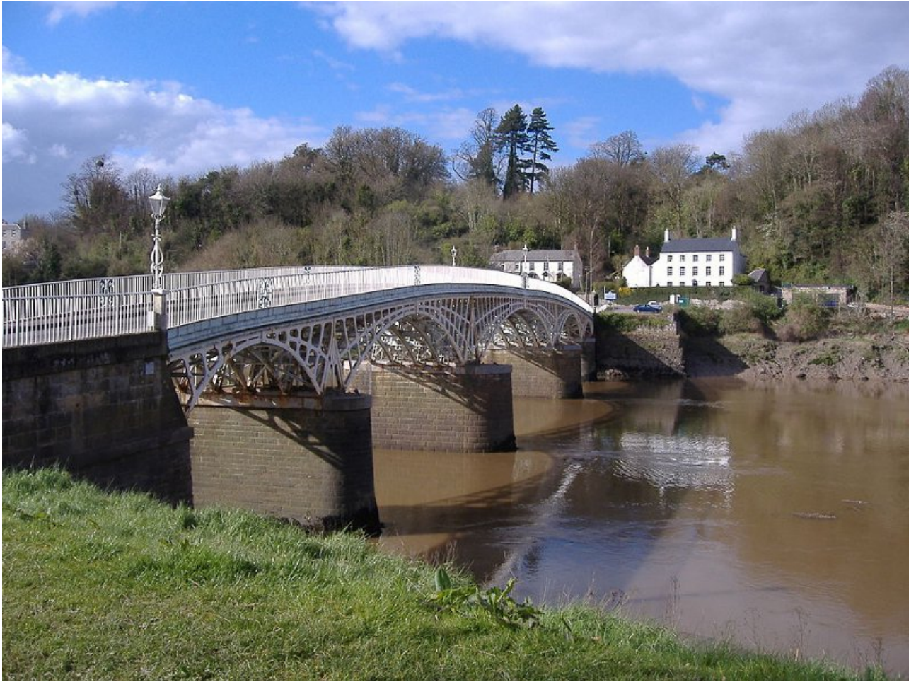
Old Wye Bridge, Chepstow

I'm the bridge of many moods I can be sunny, calm and serene But given my position My fogs and winds are mean. I'm the bridge with two gates One in England, one in Wales Don't get trapped on the 'wrong' side Because they can be shut in gales.