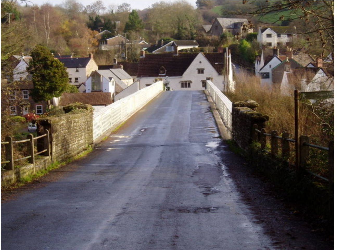
Brockweir Bridge crossing from Wales to England near Tintern