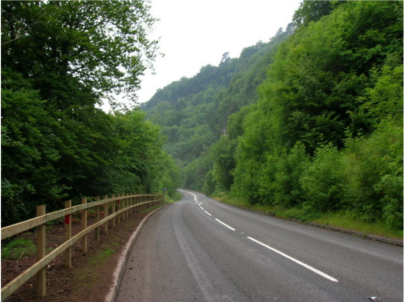
Descending the Wye Valley on the A466 towards Tintern.