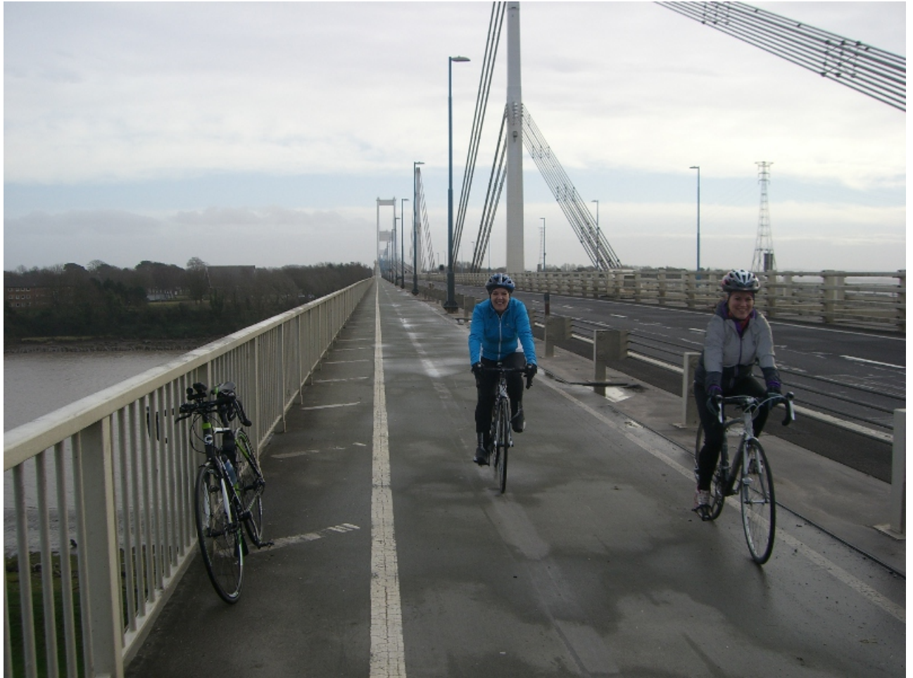
Old Severn Bridge, cycle and walkway

For feet and pedaled wheel Most know only of one From England right they peel.