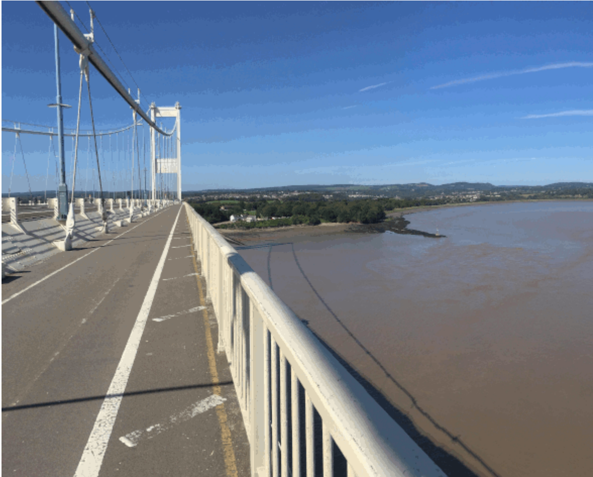
An animated panorama viewed from the Old Severn Bridge up the estuary towards the decommissioned Oldbury nuclear power station.