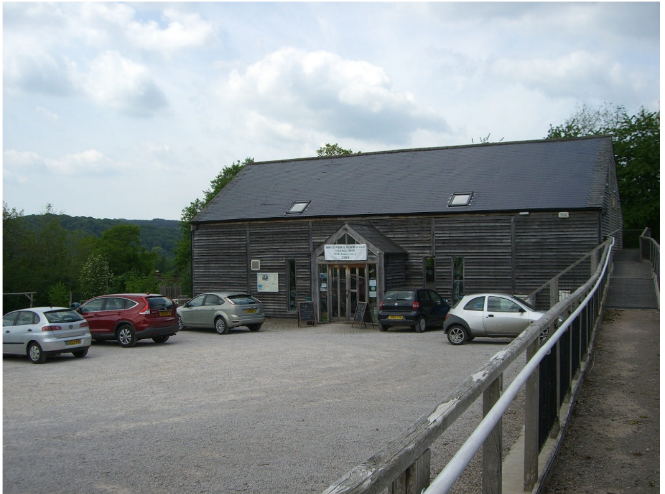
Brockweir Village Shop & Cafe at about a third of the way up a steep long hill