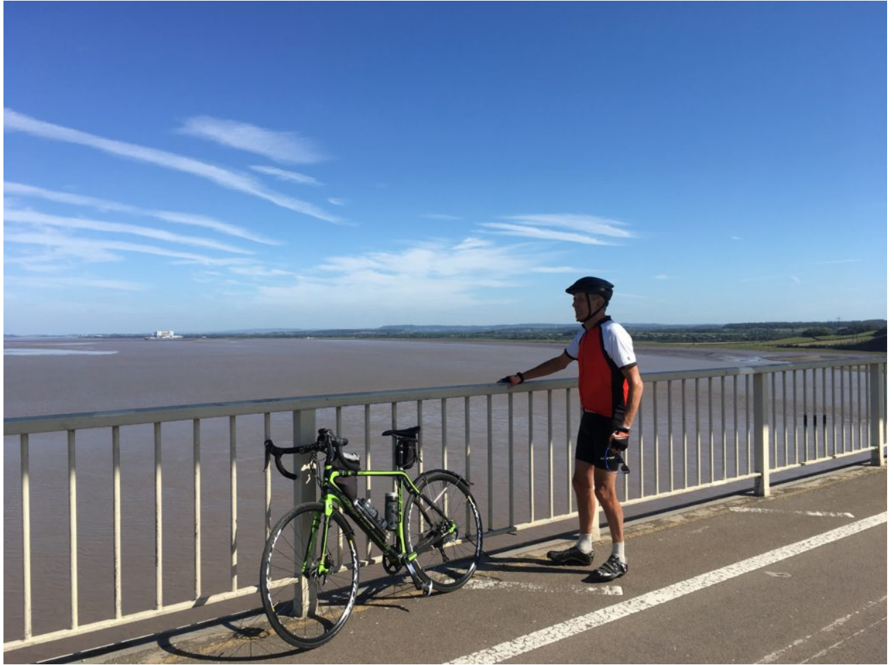
A moment of reflection on the old Severn Crossing viewed up the estuary towards Berkeley. The decommissioned Oldbury Nuclear Power Station is visible in the distance.

I'm the bridge of bygone fission Easily visible as you ride Oldbury Nuclear Station Lying just beneath one side.