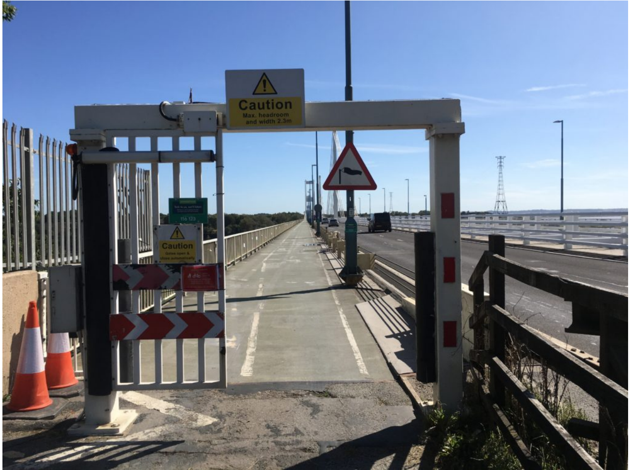
Old Severn Crossing automatic gate

I'm the bridge with listed status Whose cables were feeling pain So now my younger sibling Relieves me of some strain. I'm the bridge of two bridges The Severn and the Wye But most think we're one So invisible is our tie.