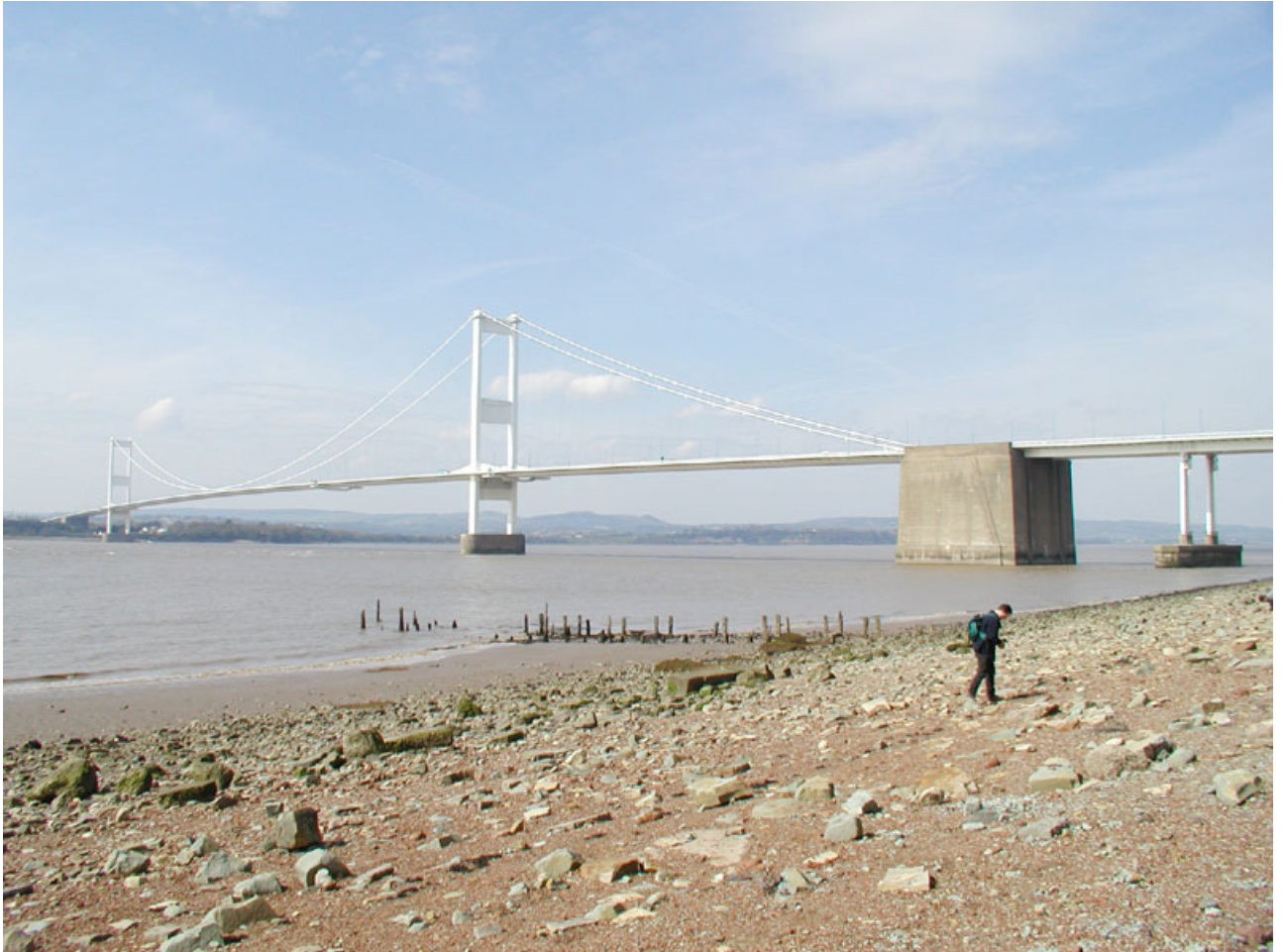
The old Severn Crossing

I'm the bridge of two rivers The Severn and Wye I'm seen from a distance My two towers in the sky. I'm the bridge of two countries England and Wales Offering a gateway To many new trails. I'm the bridge of two pathways